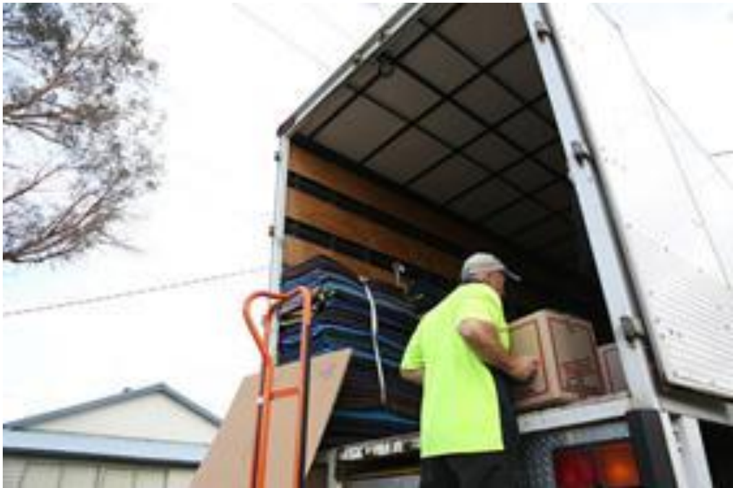
By Sunset Removals: A mover loading the removal truck with boxes photo