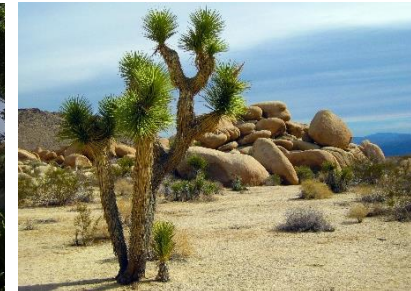
Great Victoria Desert