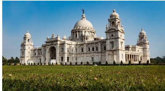
Victoria Memorial in India