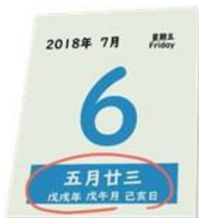
Chinese Lunar Calendar

Different celebrations begin before the day of the Festival. People enjoy the food, and see the Bun Towers and many other activities. Most people come on April 8 th to watch the Bun Scrambling Competition.