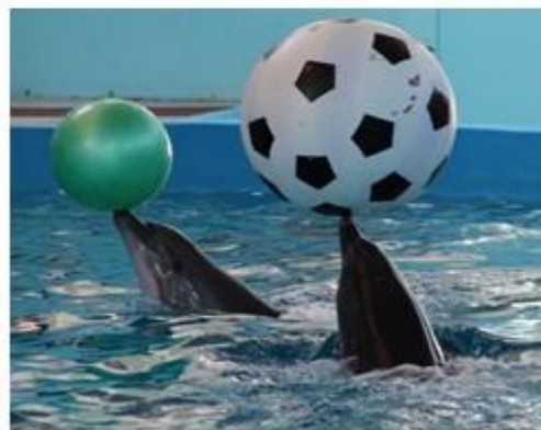
ability skill or talent