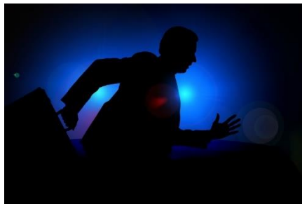
escape to run away