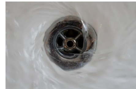
drain a pipe that carries away dirty water