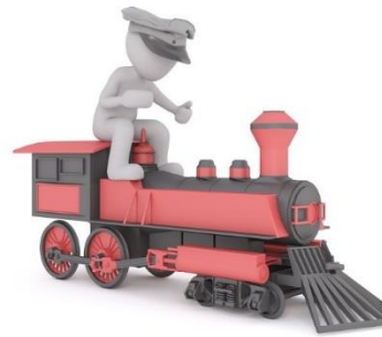
carry to take