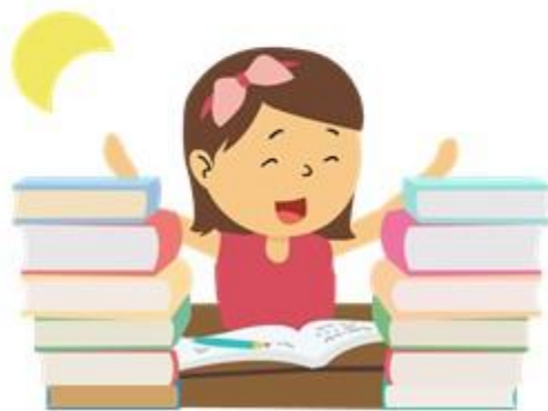
finish my homework