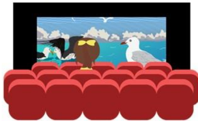
watch a movie