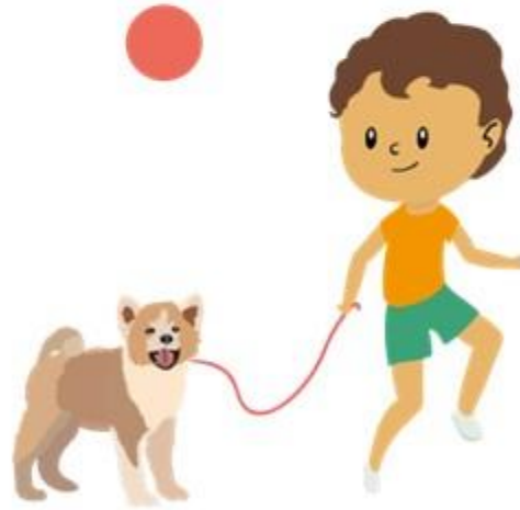
walk a dog