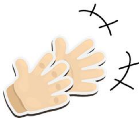
clap your hands

🎵 If you're happy and you know it, clap your hands.