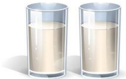
two glasses of milk