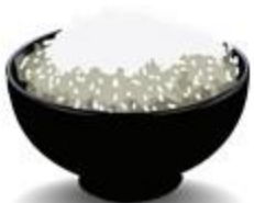
a bowl of rice