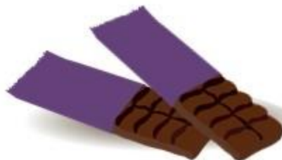
two bars of chocolate