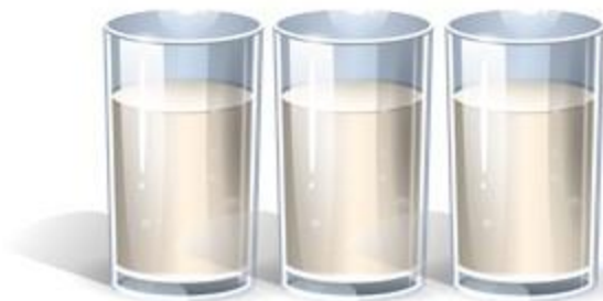
three glasses of milk