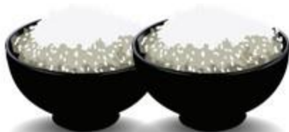
two bowls of rice