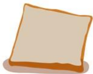
a piece of bread