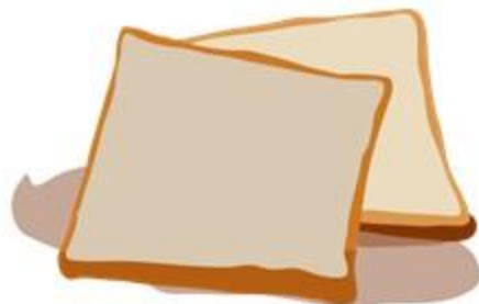
two pieces of bread