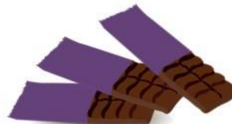
three bars of chocolate