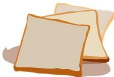
three pieces of bread