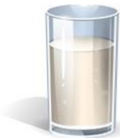
a glass of milk