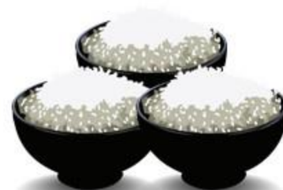
three bowls of rice