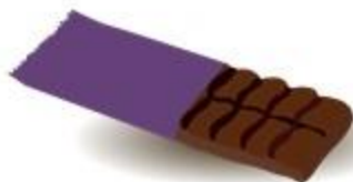
a bar of chocolate