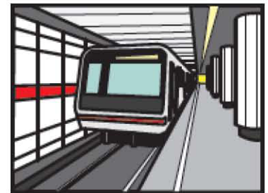
F. take the subway