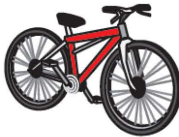
E. ride a bike