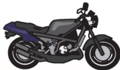
H. ride a motorcycle