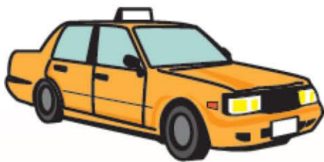
G. take a taxi