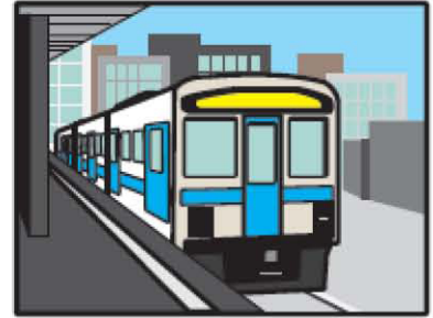
C. take the train