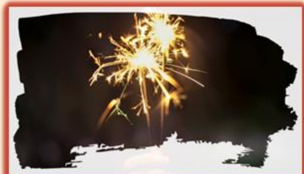
New Year's Day