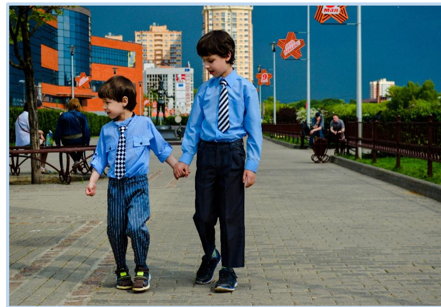
with my brother