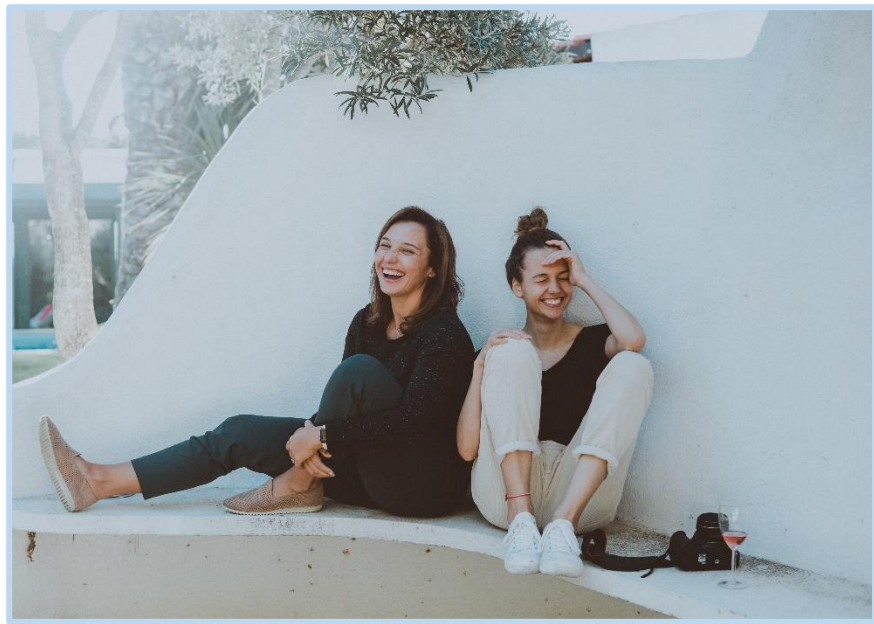
with my friend