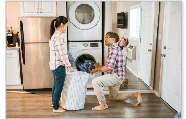
They are doing the laundry.