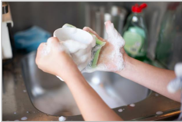
I am doing the dishes.