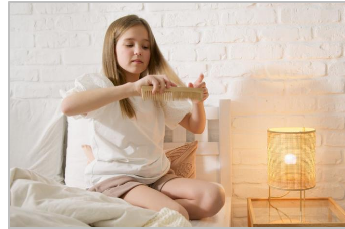
She is combing her hair.