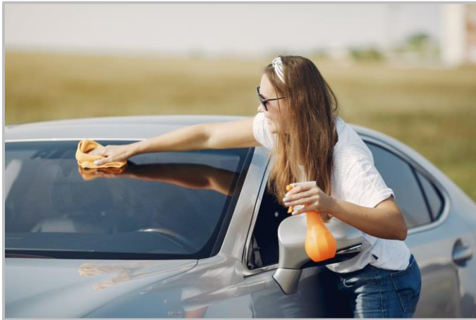
She is cleaning her car.

We use “ her ” to say that something belongs to a woman or a girl .