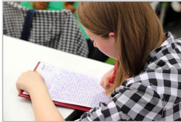
She is doing her homework.