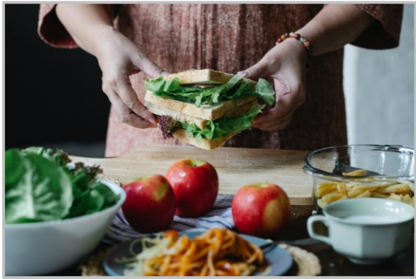
make a sandwich