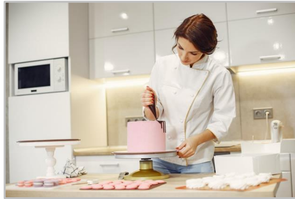
make a cake