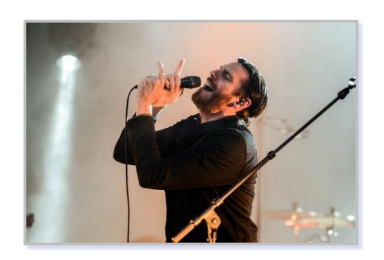
I am singing.