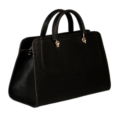
This is Aya's bag.