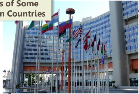
Flags of Some Asian Countries