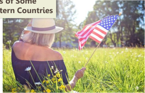
Flags of Some Western Countries