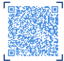
Scan and Listen