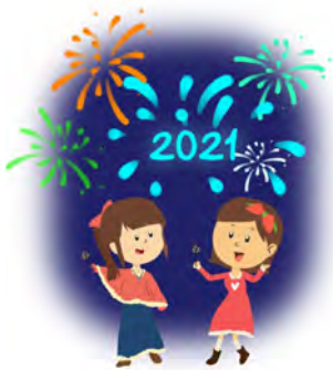
New Year's Day