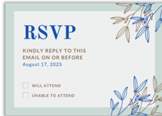
RSVP via email Formal