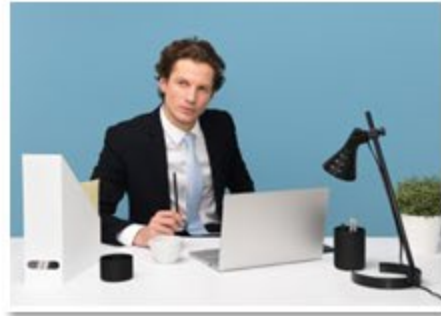
Prepare Yourself Emotionally