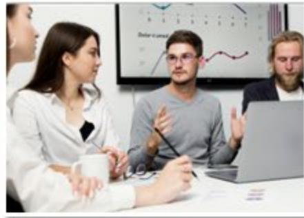
Be Gentle and Frank