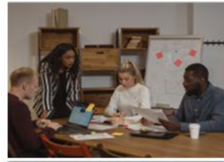
Pay Attention to Setting and Timing