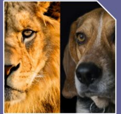
Animals and Pets