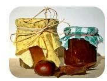
to keep for future use preserve body heat to keep warm