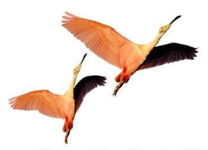
Can you describe the birds?