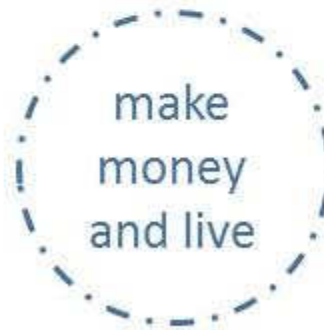
make a living