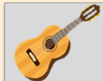
Classic Acoustic Guitar