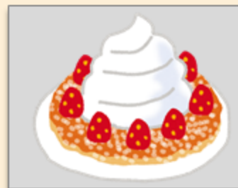
Pancake with Strawberries and Cream