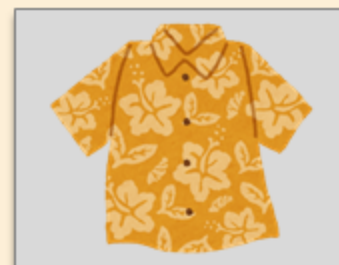
Floral-Printed Polo Shirt