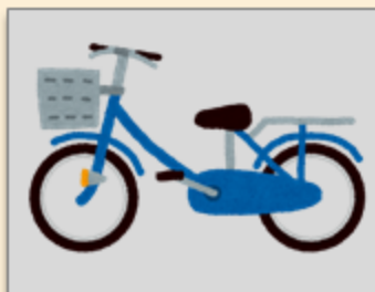
Standard Bicycle with Basket

You are a happy and satisfied customer. Write a review for each product.