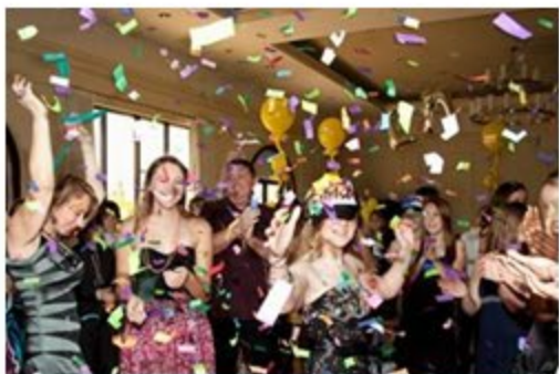
throw a party