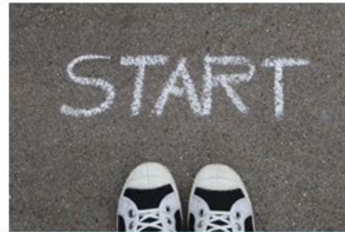
get the ball rolling