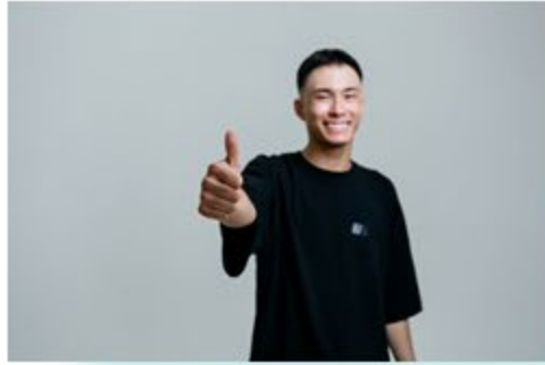
suit you taste