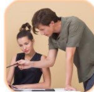
work in the company