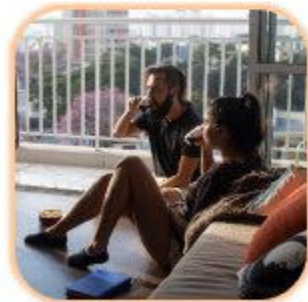
live in new apartment