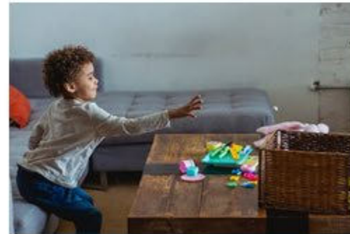
out of reach