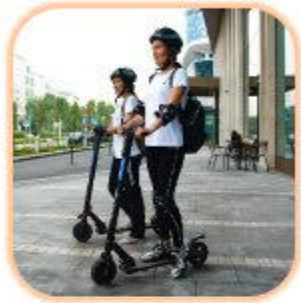
drive a scooter

Make future perfect progressive using the pictures given.