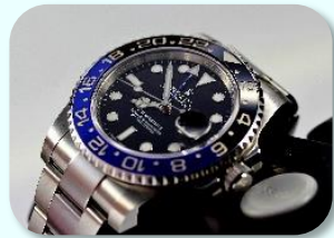
Rolex = $20,000