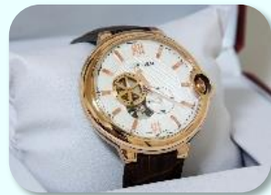
Cartier = $20,000