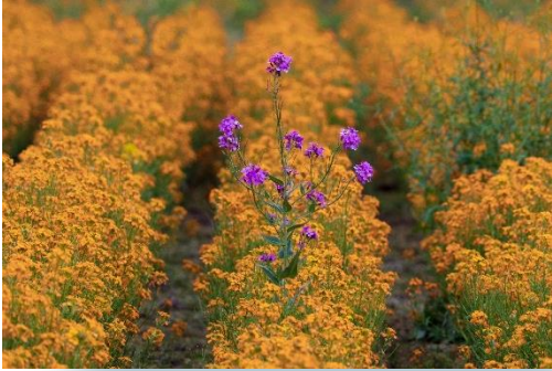
one of a kind