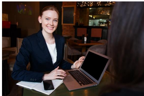
go a long way