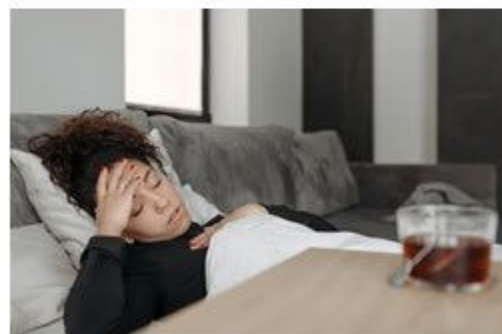
have some rest