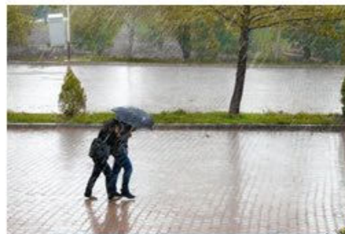
rain cats and dogs