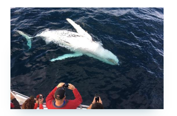
go whale watching