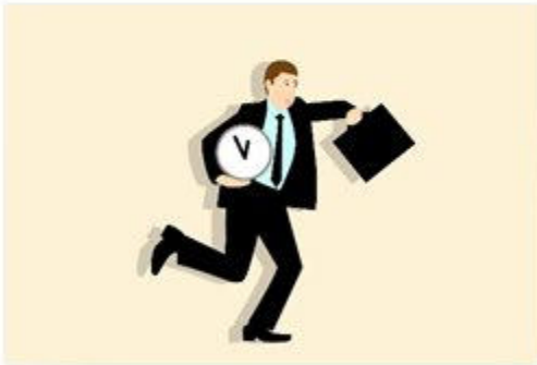
in a hurry