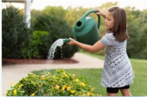
watering the flowers