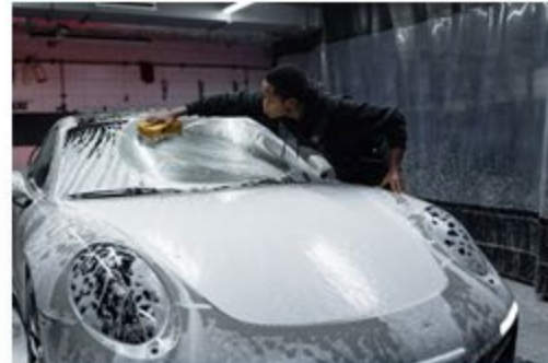
washing the car