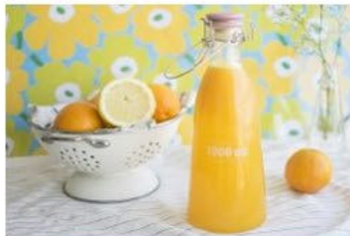
a bottle of juice