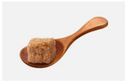
a teaspoon of sugar