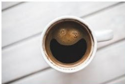
a cup of coffee