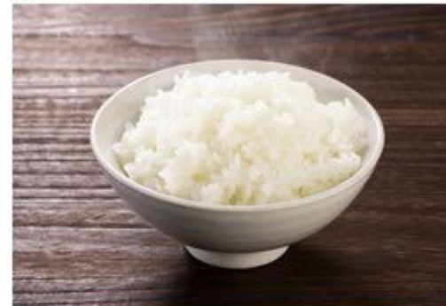
a bowl of rice