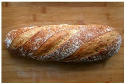
a loaf of bread