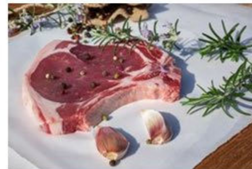
a kilo of meat