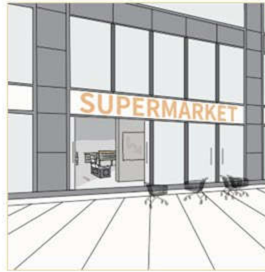
at the supermarket