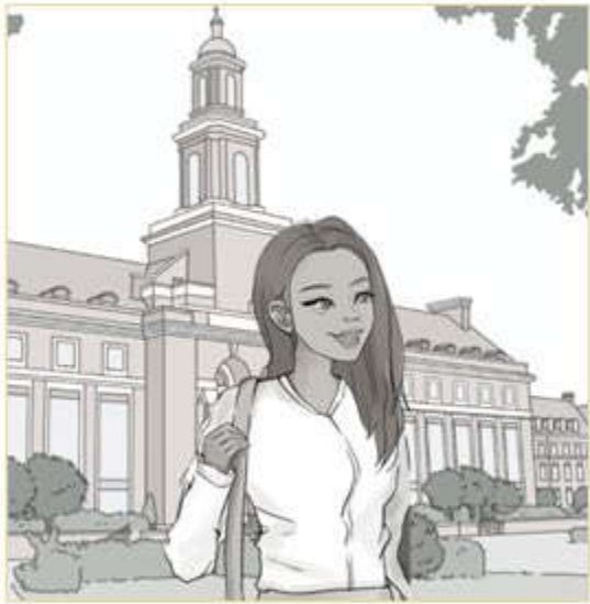
at the university

Storyline: You are friends now, then you invite her to your house.