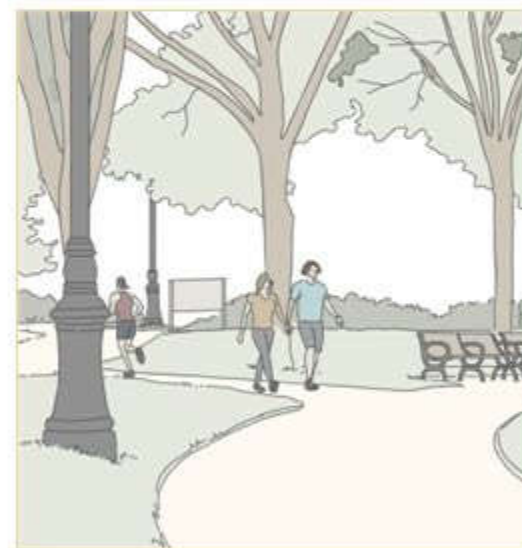
at the park