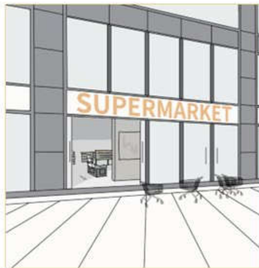
at the supermarket