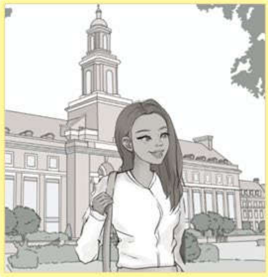
at the university

Storyline: The first place you go to is the university.