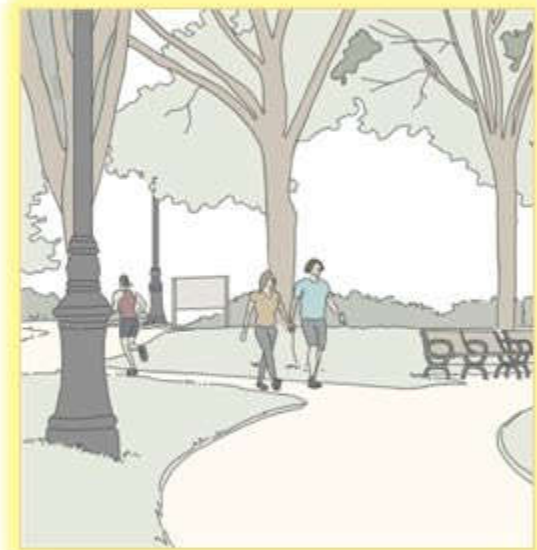
at the park