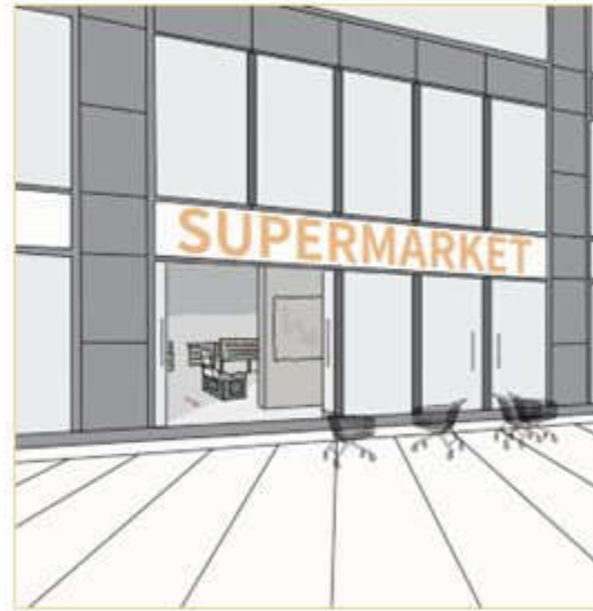
at the supermarket