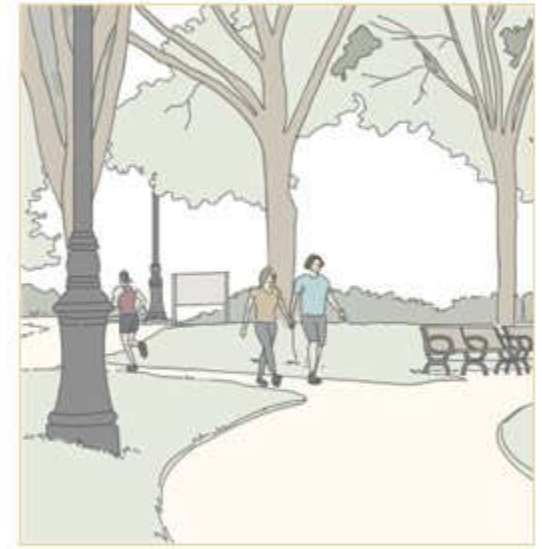
at the park