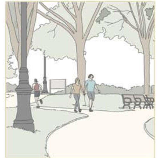
at the park