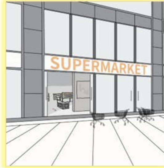
at the supermarket