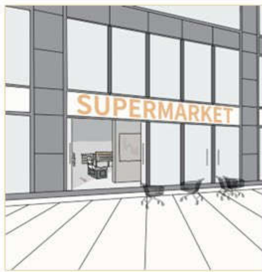
at the supermarket