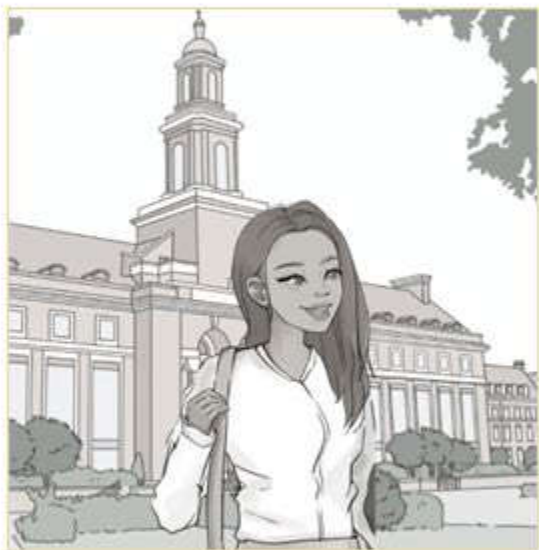
at the university

Storyline: After shopping, you go to the cherry blossom park to have a picnic.