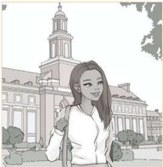
at the university

Storyline: You will meet a new friend and go to different places. In each place, you need to do some tasks.