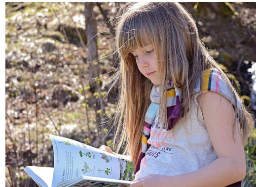
read a book