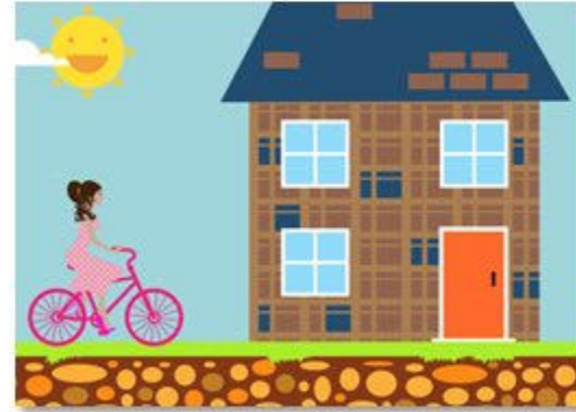
go back home