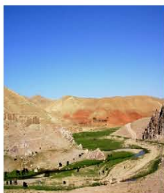
warm < hot