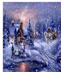
chilly < cold