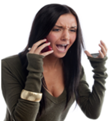
Having some problems