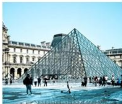
the trip in Paris