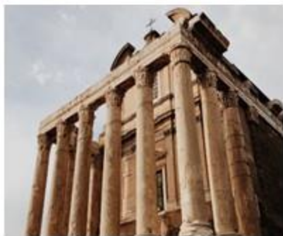
the old buildings in Rome; in ancient time

+ Please make sentences using “must have been/done” based on the pictures.