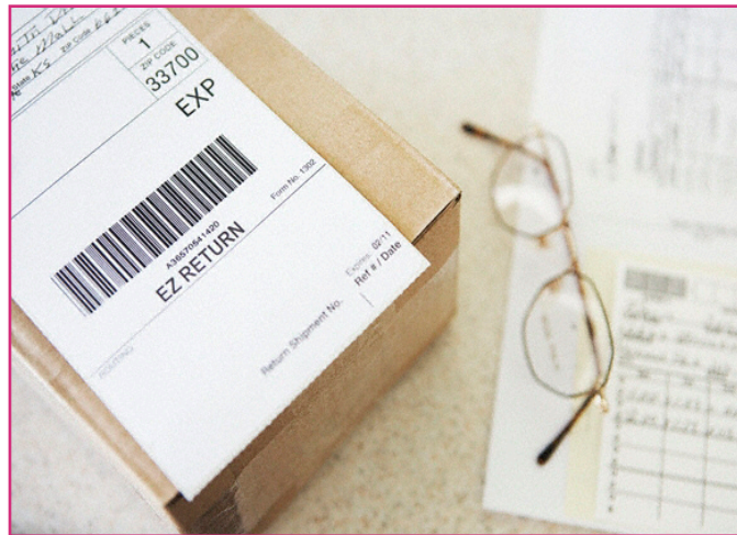
Canceling an order