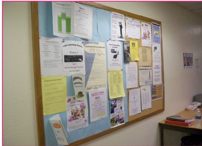
Email messages posted on the bulletin board