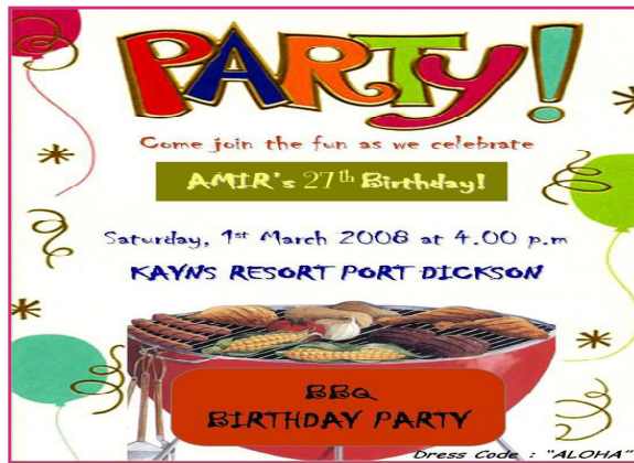
An invitation letter asking someone to attend a birthday party