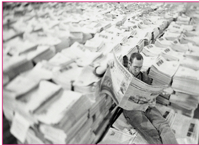
A newspaper publishing company