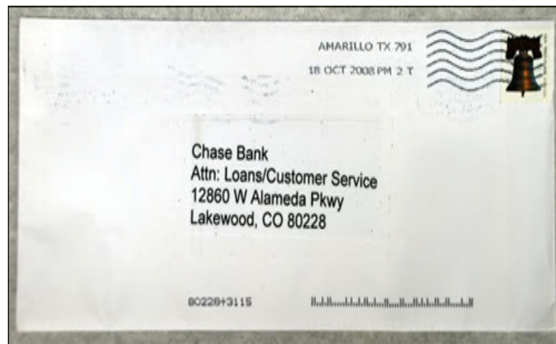
A letter from the bank