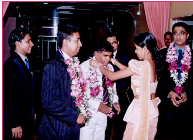
An usherette is welcoming the guests