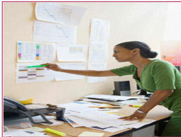
checking the schedule