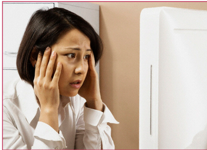
dealing with stress