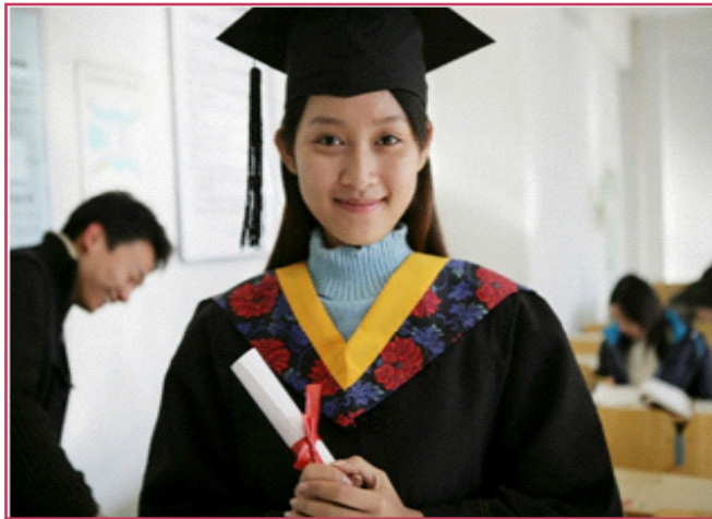
achievement from school