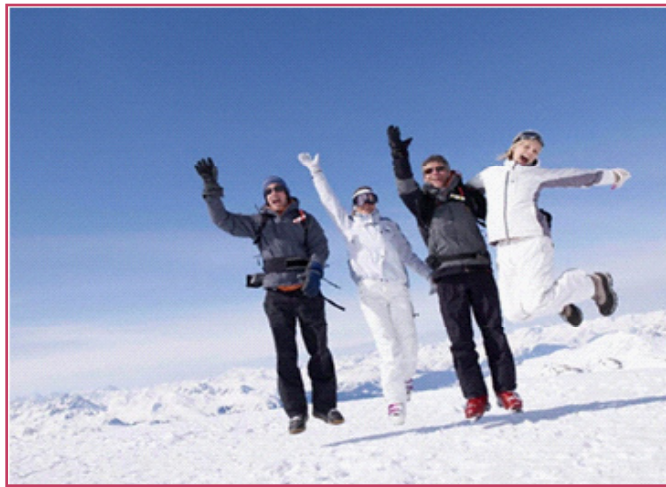
getting along with friends