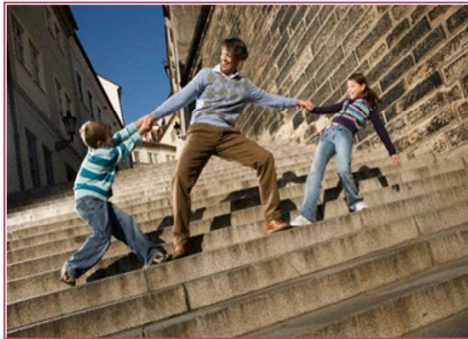
spending quality time with the family