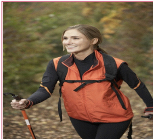
going on a hike